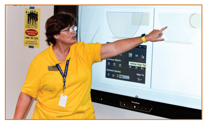
INTERACTIVE CLASSROOM AUDIO VISUAL TECHNOLOGY

ATLAS Modernization: SMART Board technology replacements with new interactive panels.